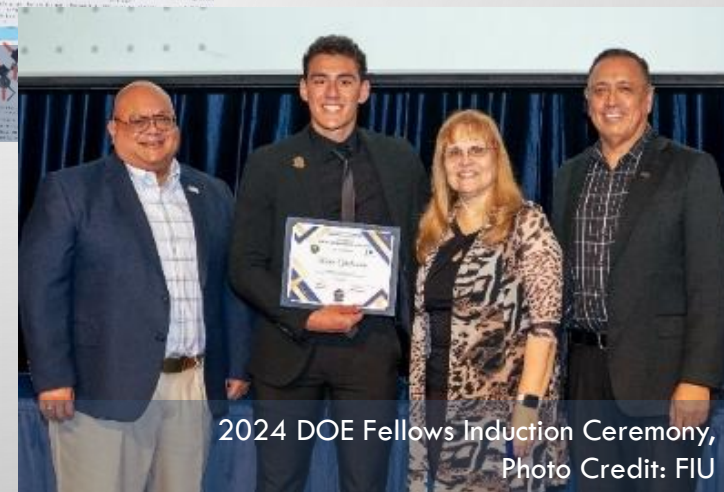
2024 DOE Fellows Induction Ceremony, Photo Credit: FIU