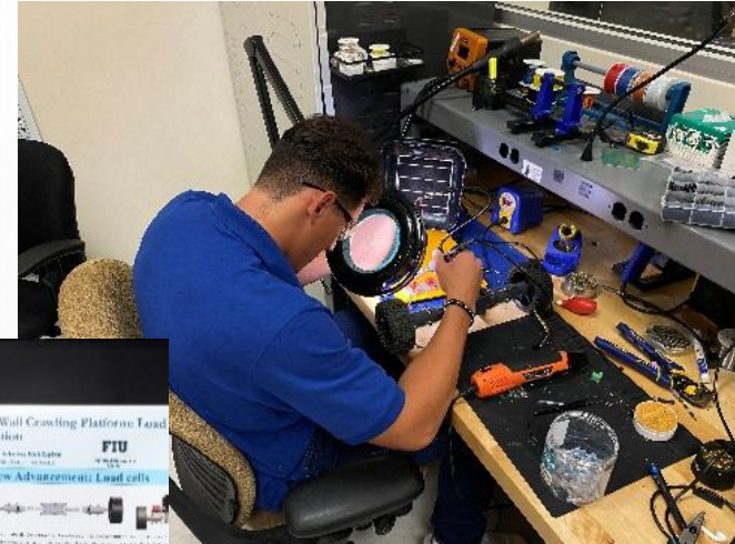
Soldering, Photo Credit: Nick Espinal