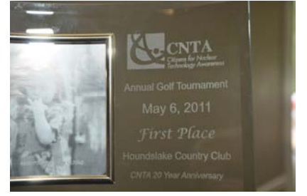
Glass-curved trophies with room for the team photo were presented to the winning team this year.