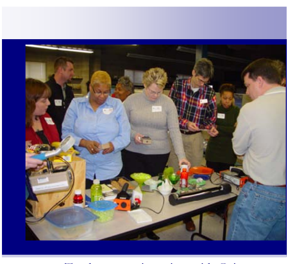
Teachers experimenting with Geiger counter and other equipment