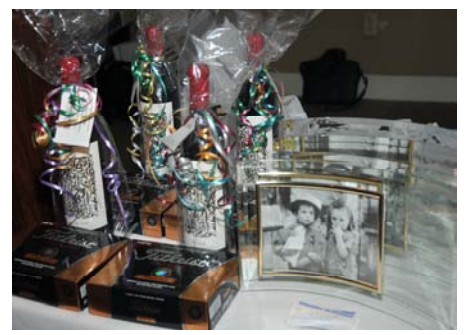
1 st Place Winners also received a nice bottle of wine courtesy of Wine World and the trophies from Trophies Unlimited

B & W TECHNICAL SERVICE SRNS ENERGY SOLUTIONS SRR URS CUMBERLAND HILLS NEWBERY HALL CRAIG WILLIAMSON HOTEL AIKEN TOAST WINE & BEVERAGE BARTRAM TRAIL PINNACLE CLUB FOREST HILLS GOLF CLUB DOUBLETREE HOTEL HAIR OF THE DOG PET SALON RCS NUCLEAR HARVARDS WINE & BEVERAGE AIKEN STANDARD GRICES BUTCHER SHOP