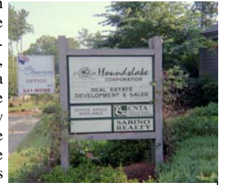
CNTA office sign at 920 Houndslake Drive in Aiken